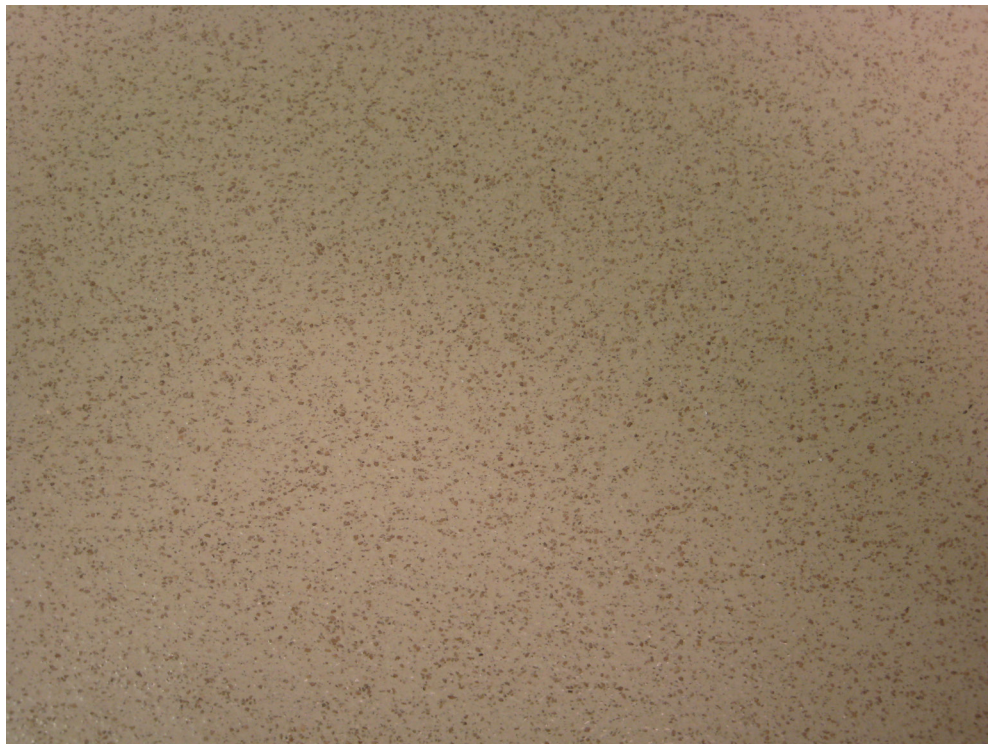
Image of Material