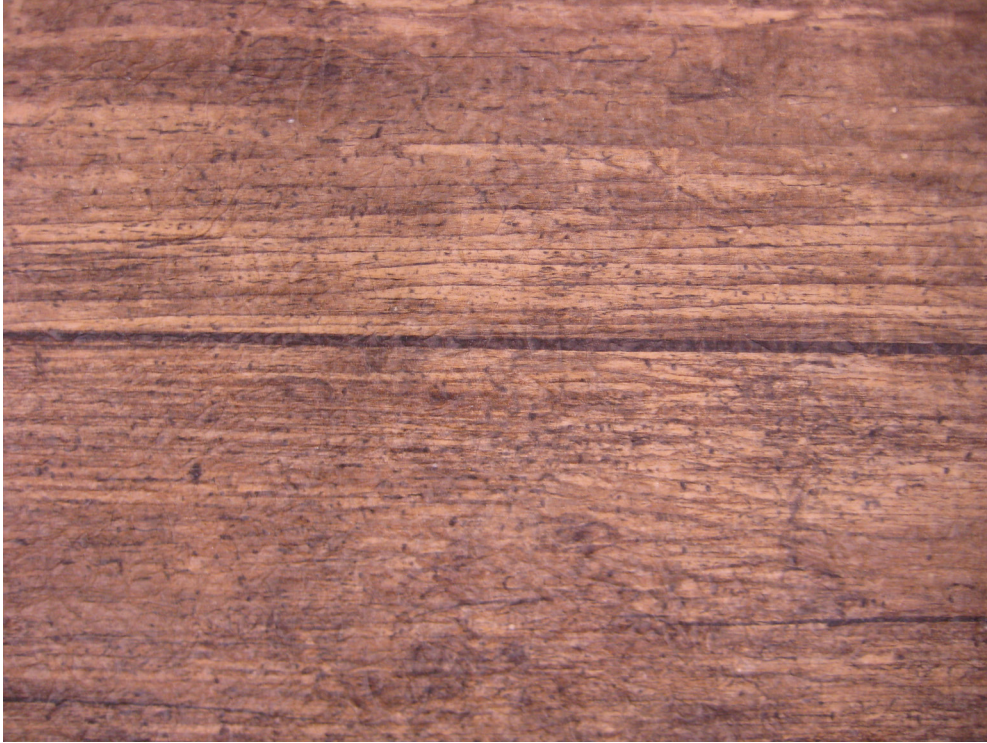
Image of Material