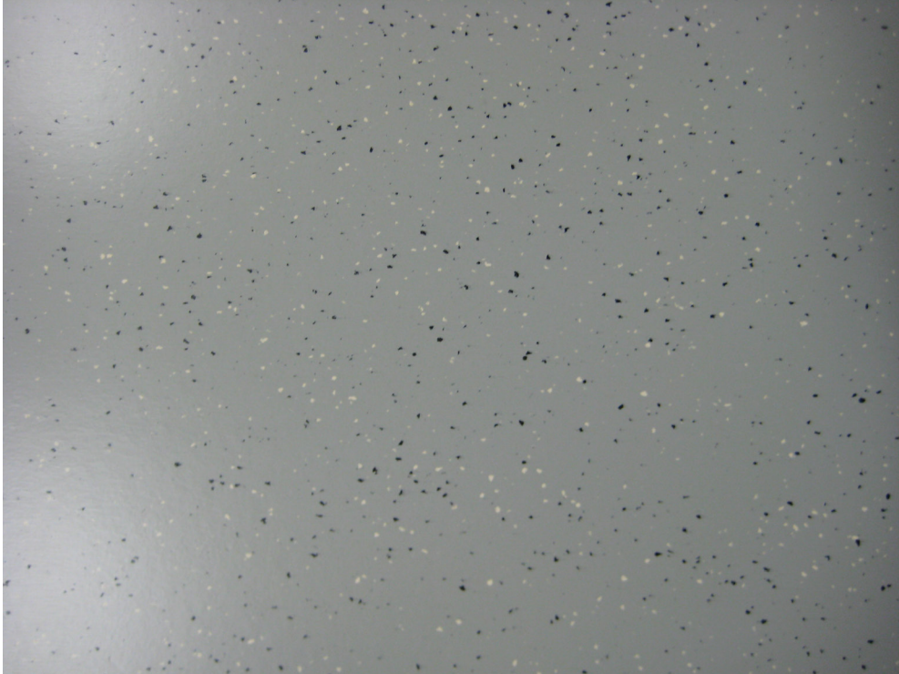
Image of Material