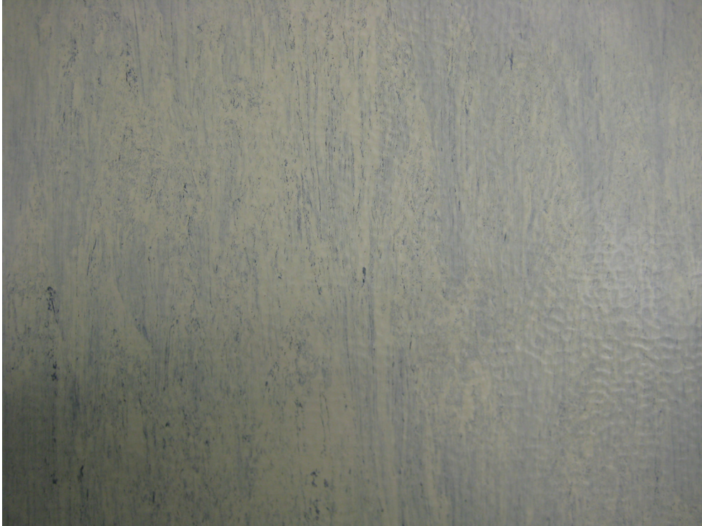
Image of Material