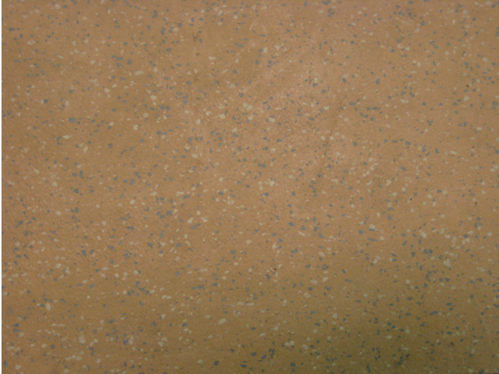
Image of Material