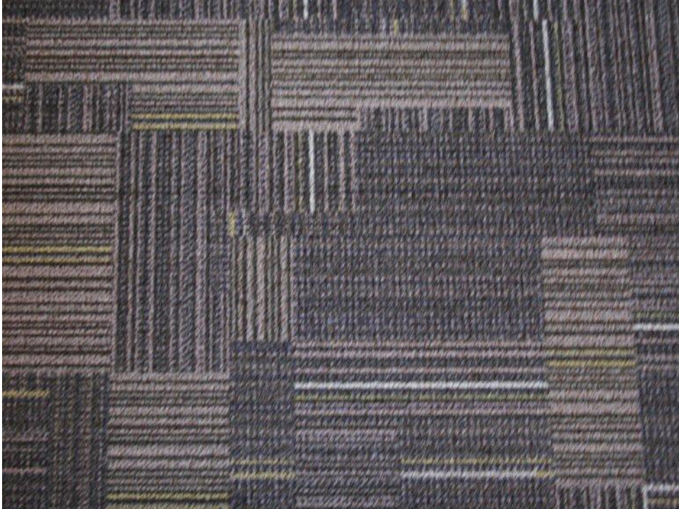
Image of Material