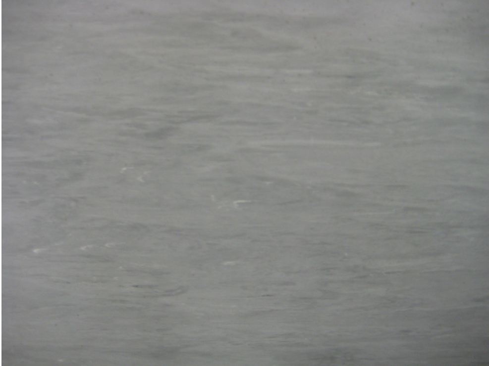
Image of Material