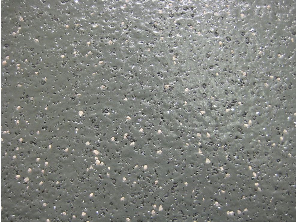
Image of Material