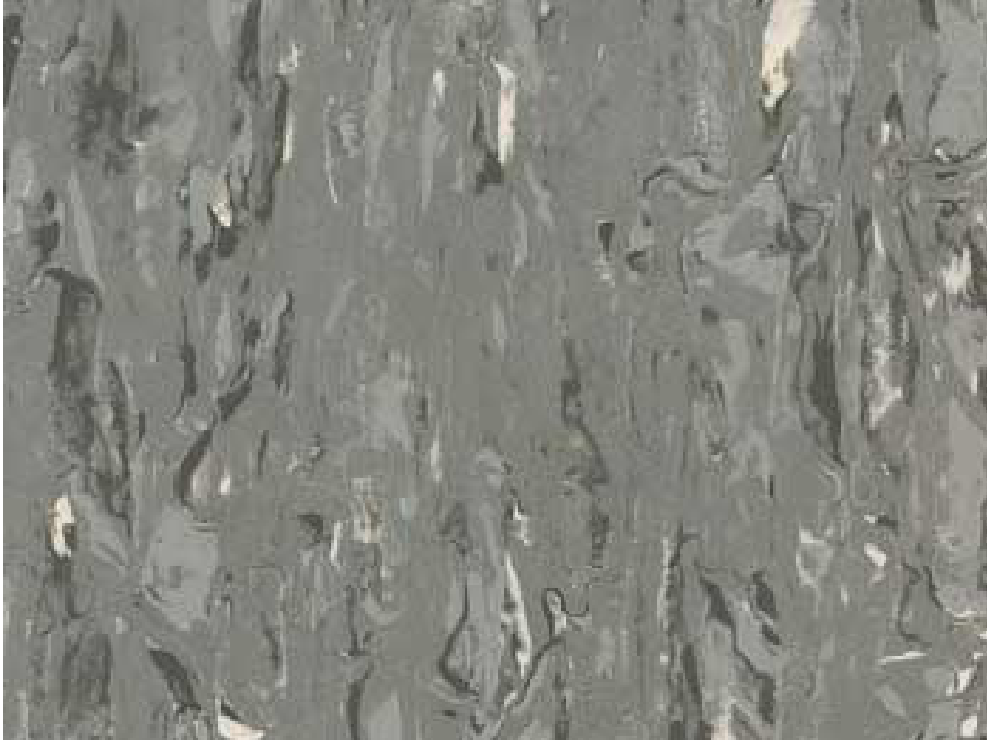
Image of Material