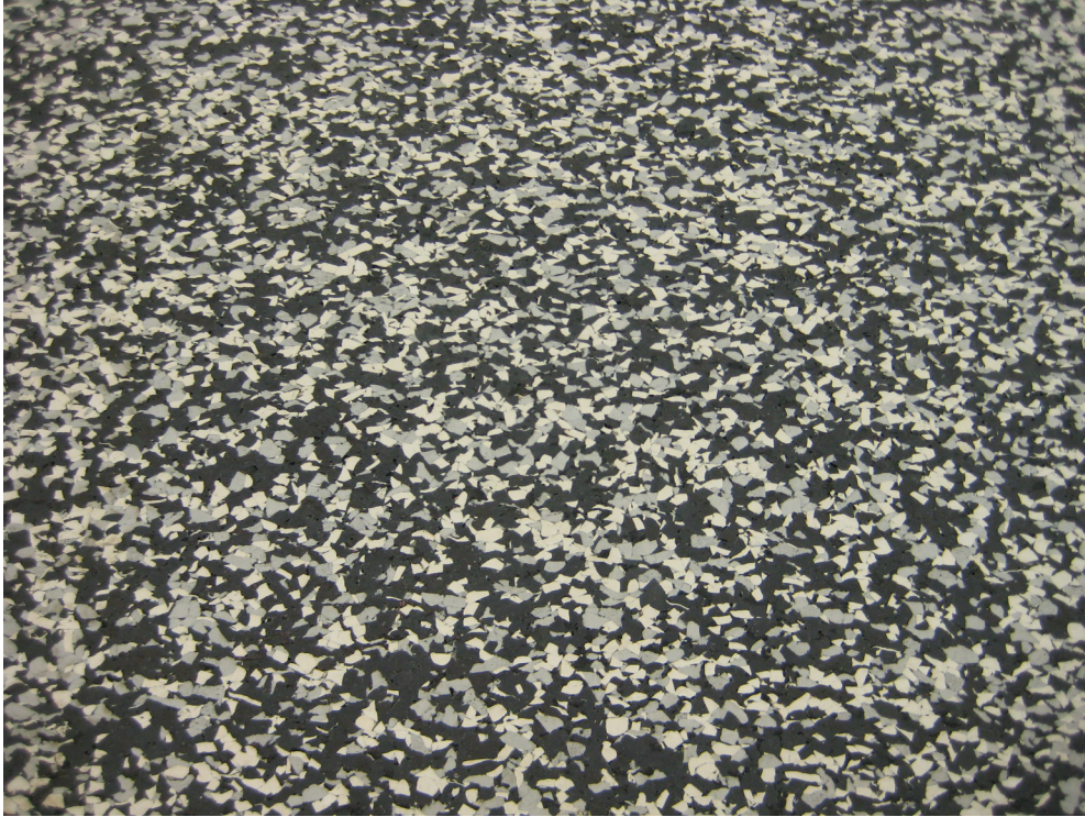
Image of Material