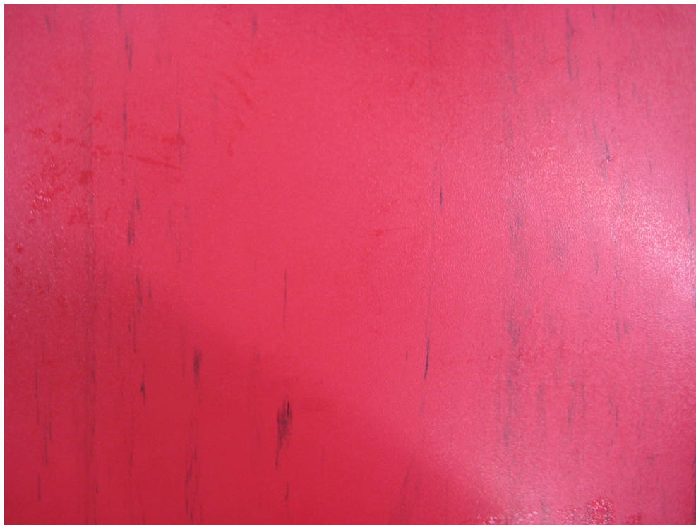
Image of Material