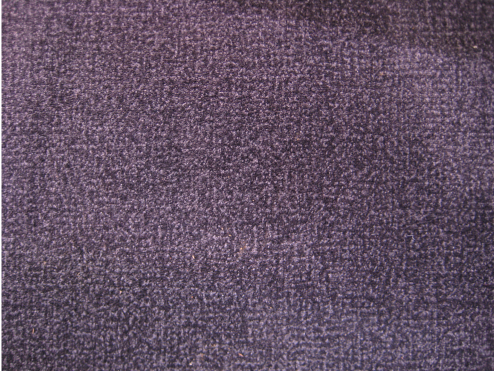
Image of Material