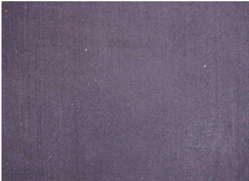
Image of Material