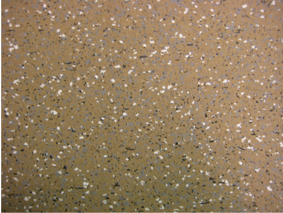
Image of Material