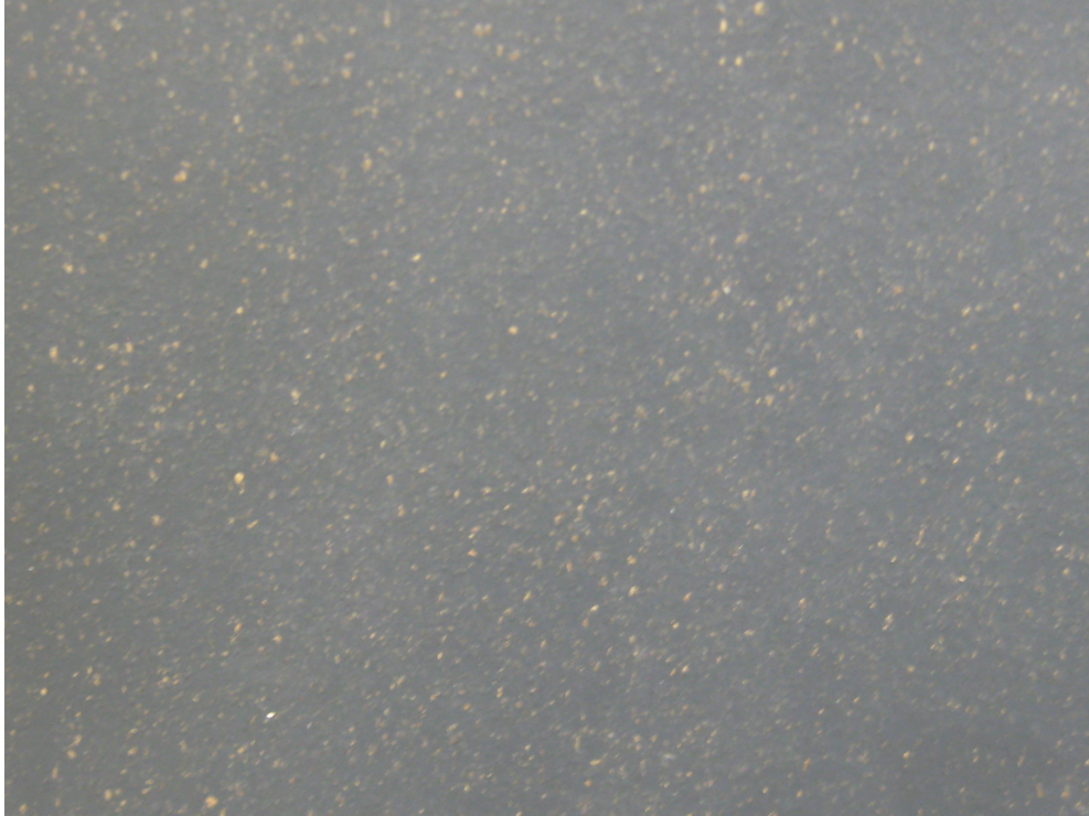
Image of Material