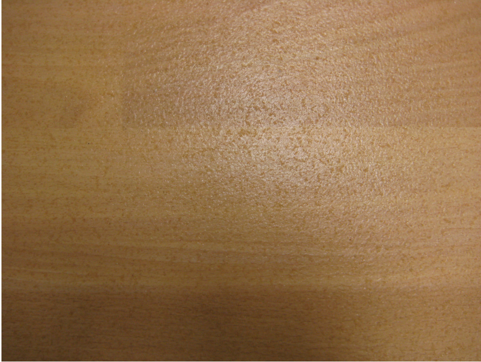
Image of Material