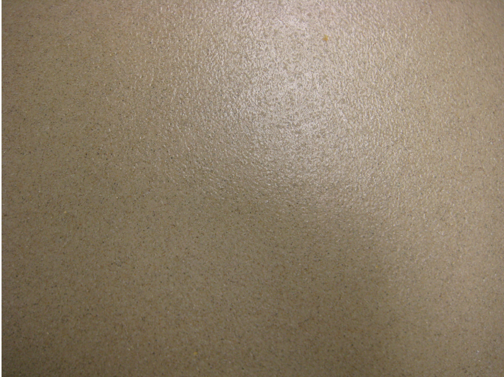
Image of Material