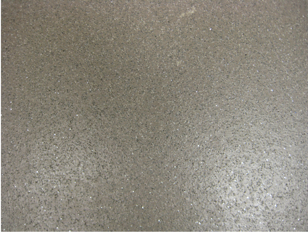
Image of Material