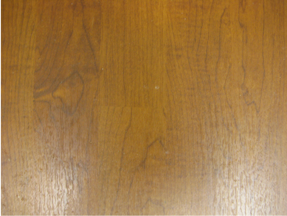
Image of Material