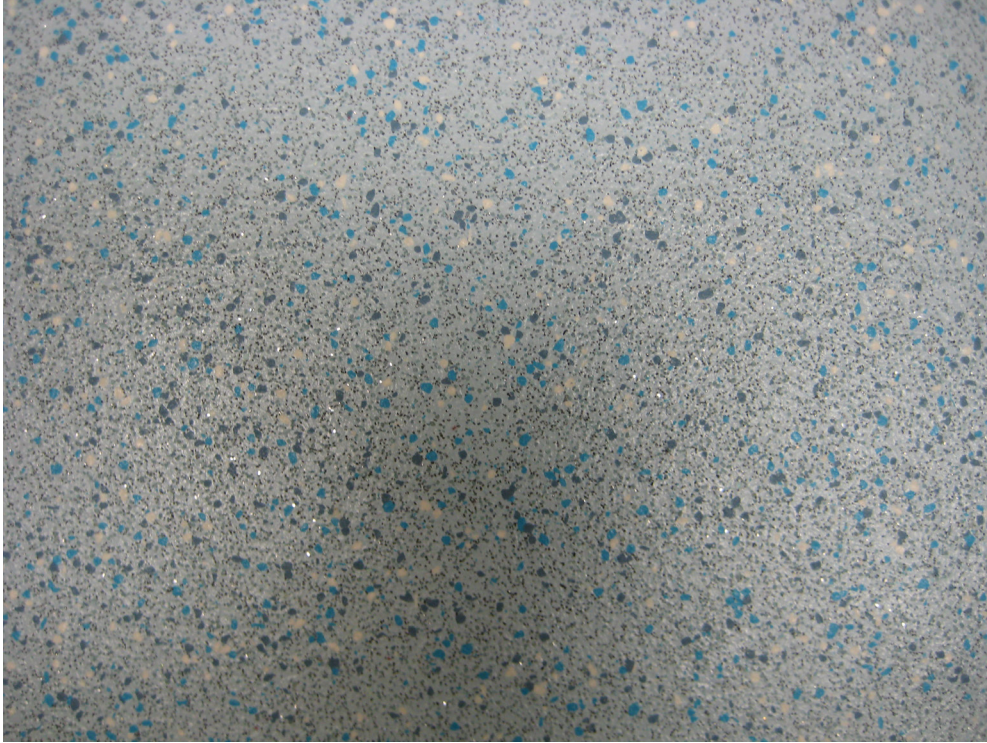
Image of Material